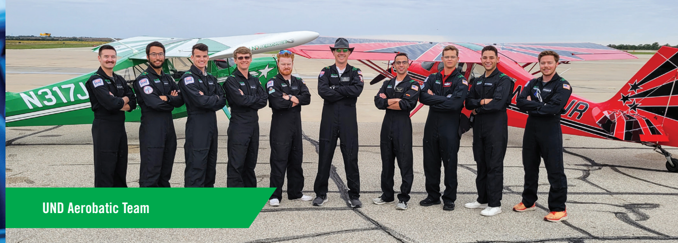
UND Aerobatic Team

“I am #UNDProud because of the amazing connections and resources that we are provided through the College of Aerospace Sciences. Connecting one-on-one with teachers through smaller classes encourages a brighter and stronger future. I am forever grateful for the opportunities I have had thus far and continue to receive through my time here at UND!”